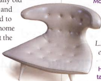
Modern white chairs