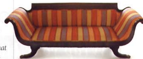
Old Telephone Exchange

"I bought this piece at a junk store in Carytown and reupholstered it with European fabric... I love using beautiful, inviting colors."